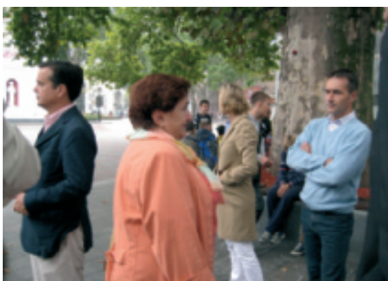
MedCruise members and Cruise Line Executives enjoy the Odessa city tour