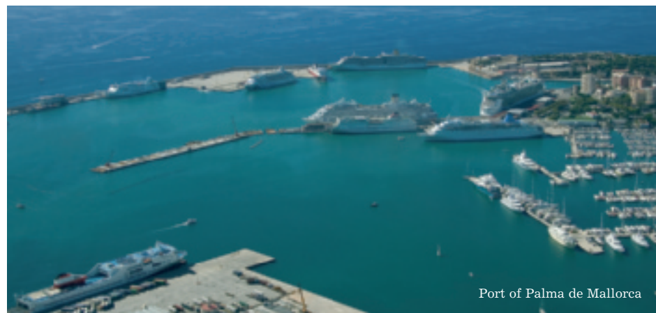
Port of Palma de Mallorca

New docks at Ibiza's Botafoch opened this year enabling the reorganisation of port activities and transfer of coastal cargo ships to a new terminal away from the old city. A new area of 75,000sq mtr providing two 200mtr long berths enables the simultaneous