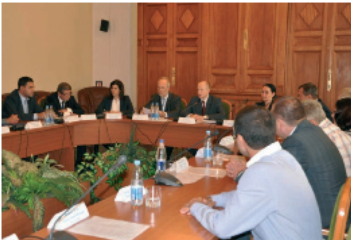
MedCruise and Marketing Project "Cruise Black Sea" meet to discuss ways of increasing cruise traffic to the Black Sea