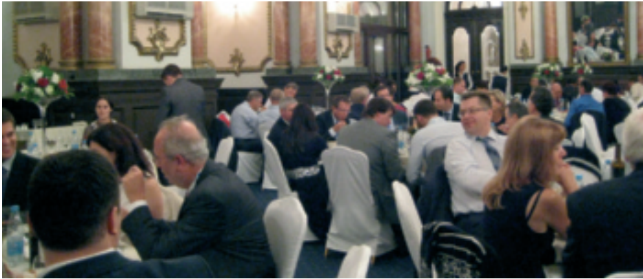
Gala dinner at the Londonskaya Hotel