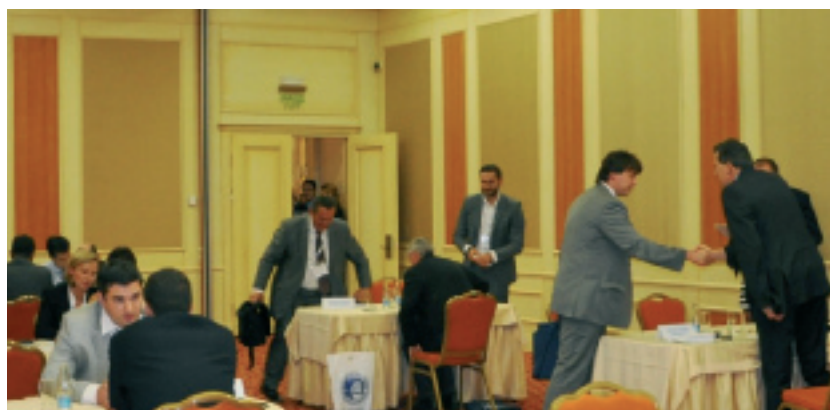
B2B meetings between Port delegates and Cruise Line Executives