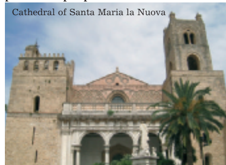
Cathedral of Santa Maria la Nuova