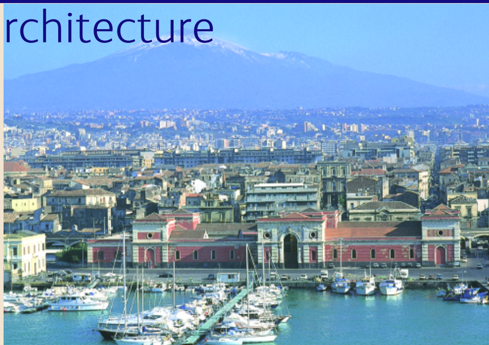
Catania – located at the foot of Mount Etna

Taormina, a short distance from Catania, is a picturesque town with a magnificent position on a terrace overlooking the Ionian