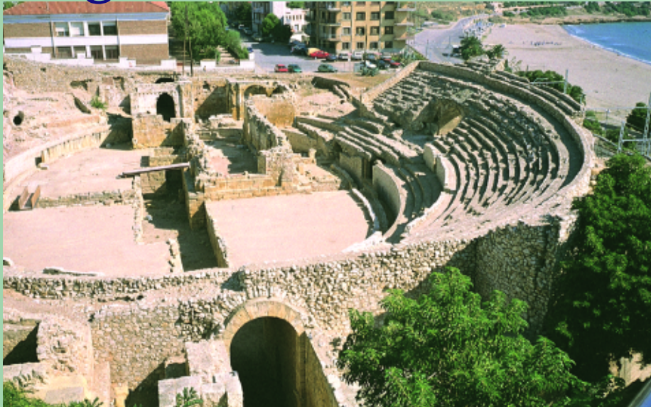
A UNESCO World Heritage site brimming with Roman and Medieval remains

T arragona is the most important port in southern Catalonia. Situated 60 miles south of Barcelona, it is a UNESCO World Heritage site brimming with Roman