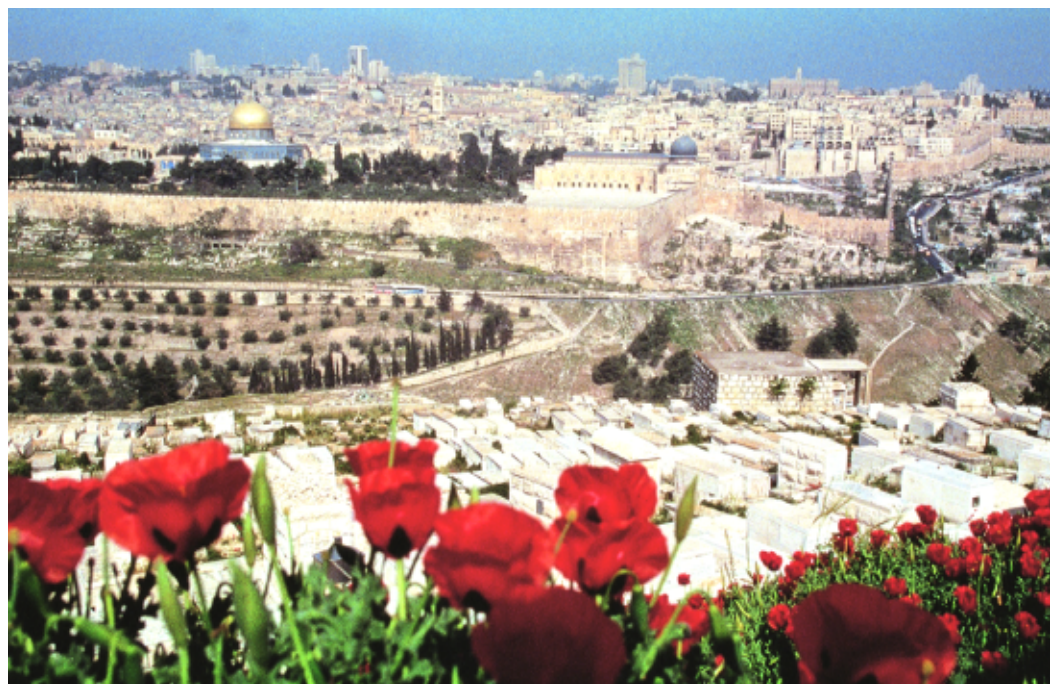
Haifa – providing access to Israel's holy cities

the Wailing Wall, the Church of the Holy Sepulchre and, in Bethlehem, the Church of the Nativity.