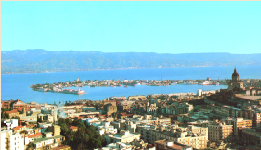
Messina – one of the gateways to Sicily

T he harbour of Messina is in the city centre, close to the main places of interest and the shopping centre and well connected with the airports of Reggio Calabria and Catania.