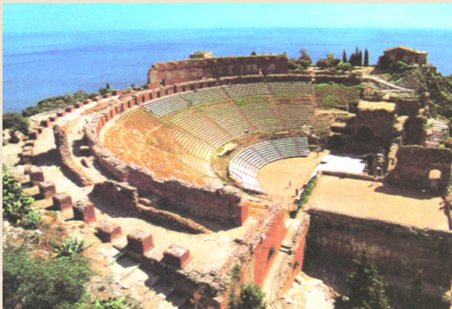
Walk to monuments and sites of interest

Even if cruise calls decrease in 2005, cruise passengers are up 5% on last year's figures, confirming the positive trend registered in past seasons and the interest in the port of Messina for the biggest vessels and cruise lines. As a matter of fact some of the most important cruise lines (Carnival Cruise Lines, Celebrity Cruises, Costa, Island Cruises, MSC, Travelplan) included Messina in their 2005 itineraries. 2005 saw 165 cruise calls to the Port of Messina bringing in 214,660 passengers. Figures for 2006 show an expected 175 cruise calls bringing in 225,000 passengers.