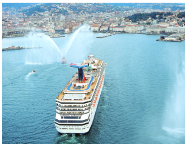
■ Carnival Conquest entering the Port of Trieste

Trieste received 18 cruise calls and 17,301 passengers in 2005. Expected calls for 2006 look set to double with 42 calls booked so far and an estimated 60,000 passengers to the port.