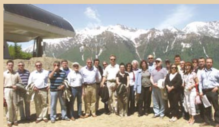
MedCruise delegates at Krasnaya Polyana

The visit to the resort, in the Caucasus Mountains, brought the delegates from the