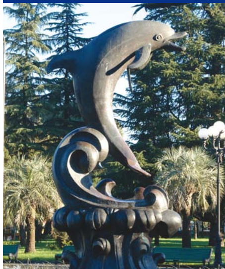
The dolphin is the symbol of Batumi

T he Black Sea city of Batumi is a popular holiday destination for Georgians due to its warm, sub-tropical climate. Located on a bay lined with sweeping beaches this colourful city boasts palms, cypress and citrus trees abundant with fruits and flowerbeds that bloom year-round. Closeby are the Botanical Gardens containing more than 4,000 species of flora from around the world.