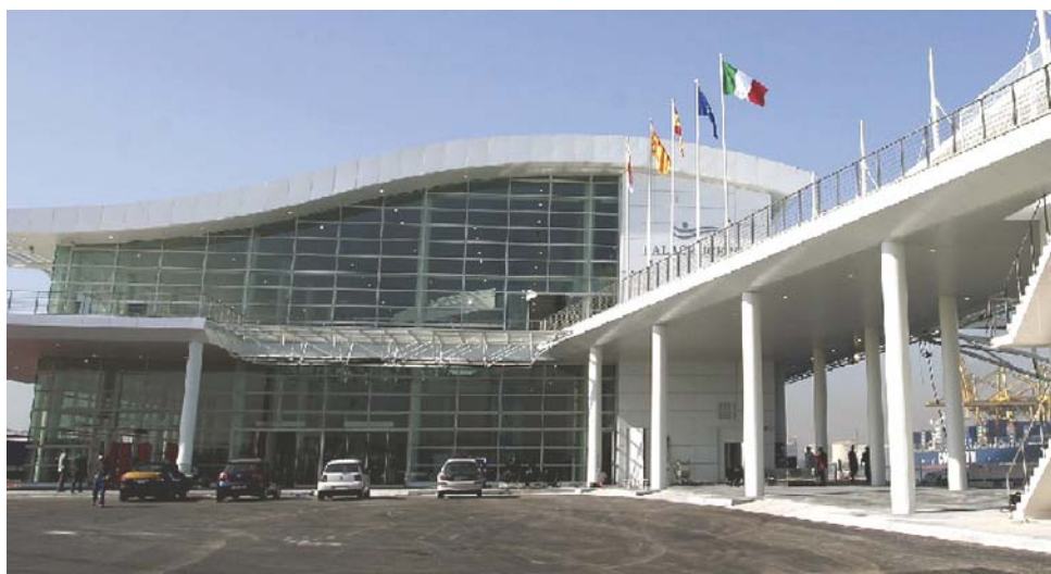
Palacruceiros at Barcelona's Moll Adossat pier

Palacruceiros has a surface area of almost 10,000sq mtr on three levels. It incorporates an Internet Cafe, a VIP lounge, Children's Club, shopping area and a cafeteria and terrace with panoramic views over the Mediterranean. Costa Crociere has invested approximately €12m in the new facility, which will handle 126 Costa Crociere vessels' port calls during 2007, bringing a total of 330,000 passengers through the Port of Barcelona.