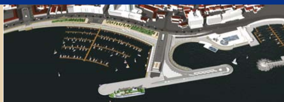
Artists impression of the new 'Gateways of the Sea'

The 1,200sq mtr Maritime Terminal and adjacent 5,300 sq mtr Commercial Zone is designed to serve both inter-island traffic and