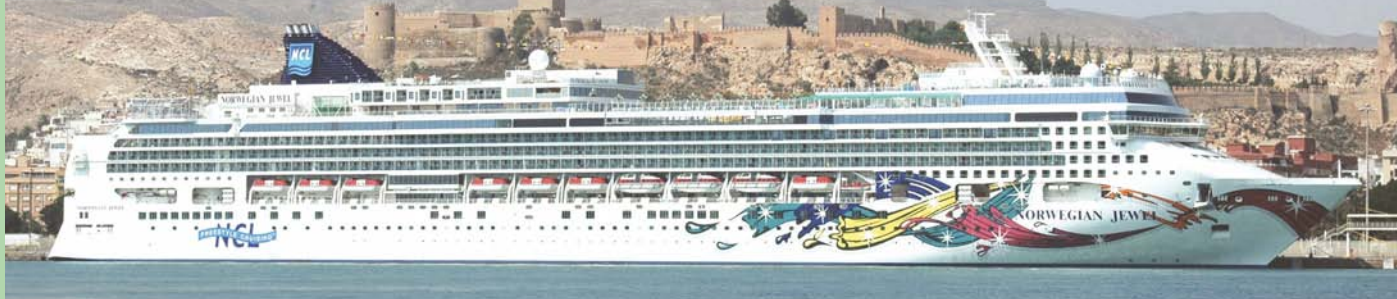
Norwegian Jewel at the Spanish port of Almeria

I n October MedCruise members are invited to the Spanish port of Almeria which is hosting the next general assembly between 18-19 th .