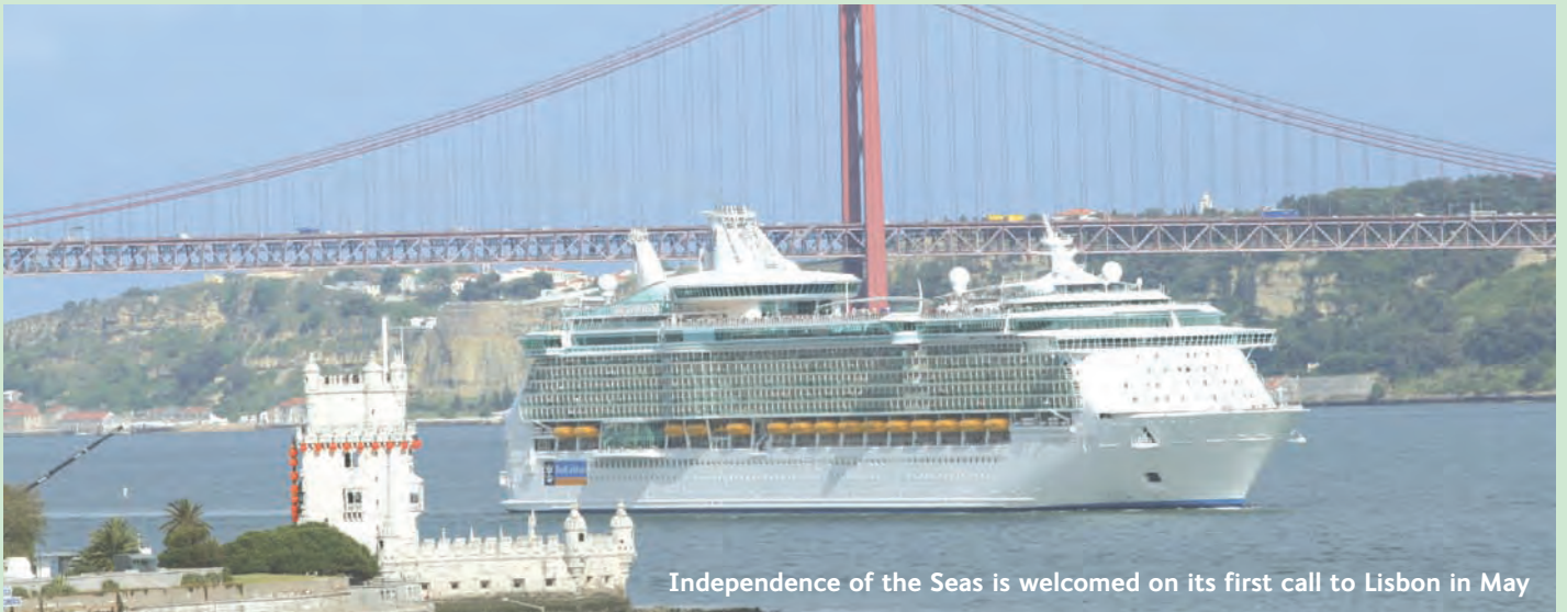
Independence of the Seas is welcomed on its first call to Lisbon in May

I ndependence of the Seas, Royal Caribbean International's newest ship, became the largest cruiseship ever to visit the Portuguese capital, when she arrived in Lisbon on May 14.