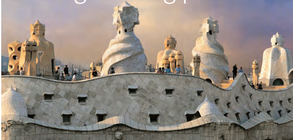
La Pedrera, a Gaudi building in Barcelona

In recent years, Barcelona has become one of Europe's top five tourist cities spurred by business tourism, meetings tourism, city breaks and cruise tourism.