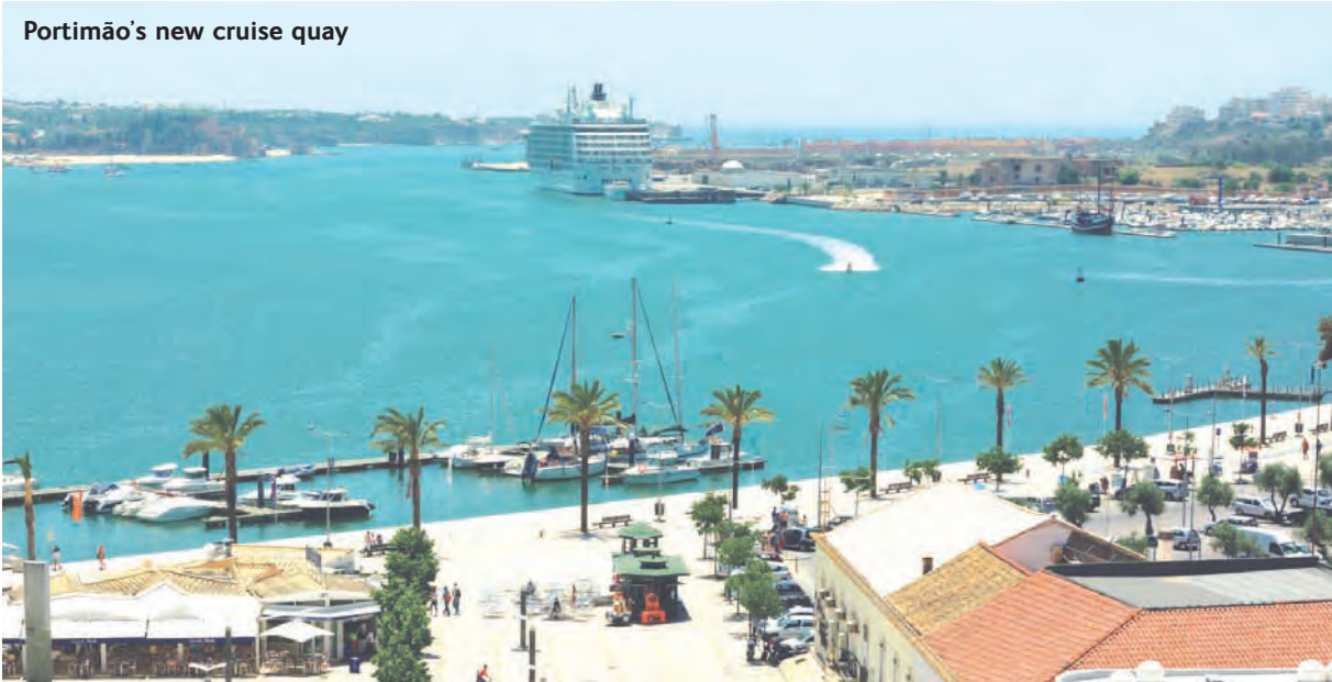
Portimão's new cruise quay

The project involved removing more than 435,000cu mtr of sand and mud which has been deposited off the coast under strict environmental rules, supervised by the National Institute of Biological Resources at a cost of €47,000. The contract included the monitoring of surface water quality and effect on organisms, both at the dredging site and at the sites where the spoils are deposited.