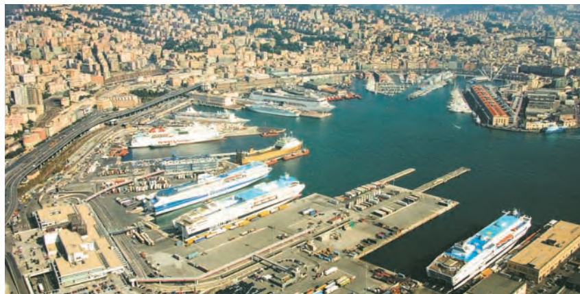
Genoa – accessible city

Meanwhile Motril, located on the Andalucian coast is the latest Spanish port to seek MedCruise membership. Offering three quays, it is an excellent gateway for visiting the Alhambra Palace in Granada (45 minutes away) but also has some interesting historic places in the city itself, with its mix of Phoenician, Roman and Arab cultures. Other places of interest closeby are Salobrena (10 minutes away), a town packed with whitewashed houses clinging to the rocks just back from the shoreline, topped by a Moorish castle and surrounded by sugar cane plantations and for winter Med itineraries in particular, the Sierra Nevada ski resort is just 1 hr 30 minutes from the port area.