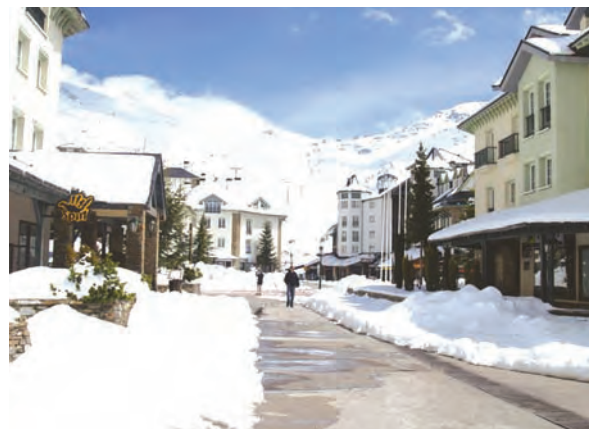
Sierra Nevada winter shorex from Motril