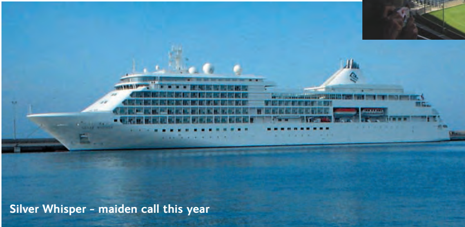
Silver Whisper - maiden call this year

Guixols will house the Thyssen art collection next year; it is just 10 minutes away from Palamos. The Costa Brava offers natural scenery with a landscape combining sea and mountain, a vast historical and cultural heritage, multiple sports activities and gastronomic variety.