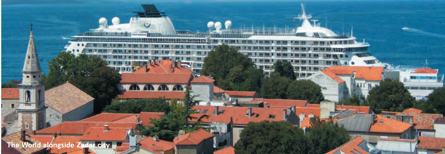
The World alongside Zadar city

T he most popular tours taken by cruise passengers arriving in to the 3,000 year old Croatian port city of Zadar are St. Donat's Church, The Sea Organ and The Monument to the Sun as well as five national parks.