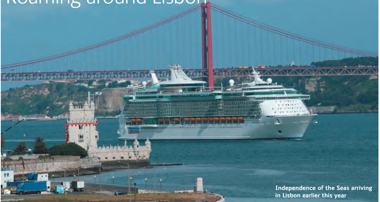
Independence of the Seas arriving in Lisbon earlier this year

Red Tour offers self-guided sightseeing circuits, using electric vehicles, with a talking GPS audio guide providing information ranging from orientation and local facts to the best amenities and historical places.