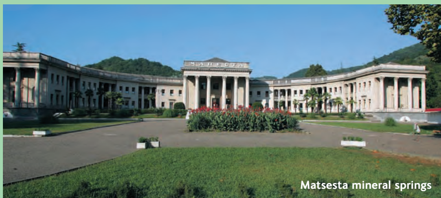
Matsesta mineral springs

The Port of Sochi is expecting about 40 cruiseships in 2009 and around 23,000 passengers, up from 33 calls and 19,000 passengers in 2008. New visitors this year include Amsterdam, Deutschland, Saga Rose, Seven Seas Navigator, The World, Artemis, Rotterdam, Minerva and Delphin Voyager.