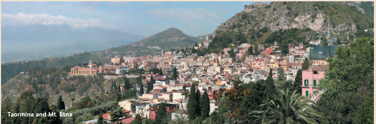
Taormina and Mt. Etna

The harbour of Messina is located very close to the city centre and the main places of interest and shops can be reached easily by foot from the cruise quays. Also close by are the Reggio Calabria and Catania international airports.