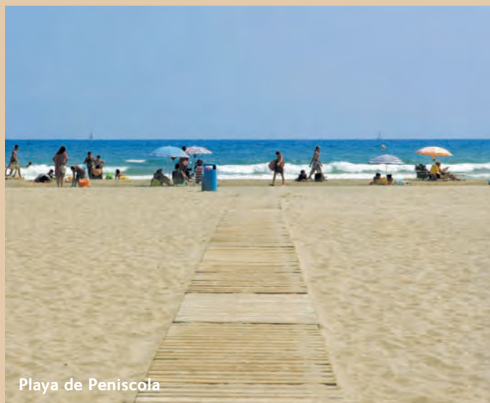
Playa de Peniscola

of Castellón, rises up before your eyes offering an awe-inspiring view composed of centuries-old battlements crowned with a large castle situated at over 1,000 mtr above sea level. Peniscola is an ancient city housing a 14th Century castle perched on a rocky outcrop soaring 64 mtr above the sea.