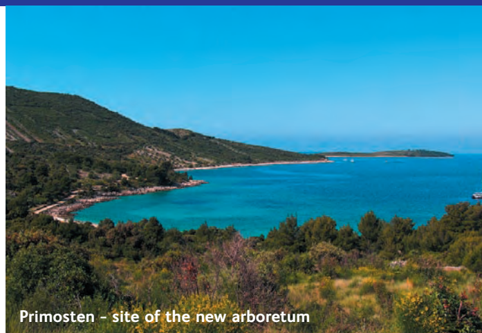
Primosten – site of the new arboretum