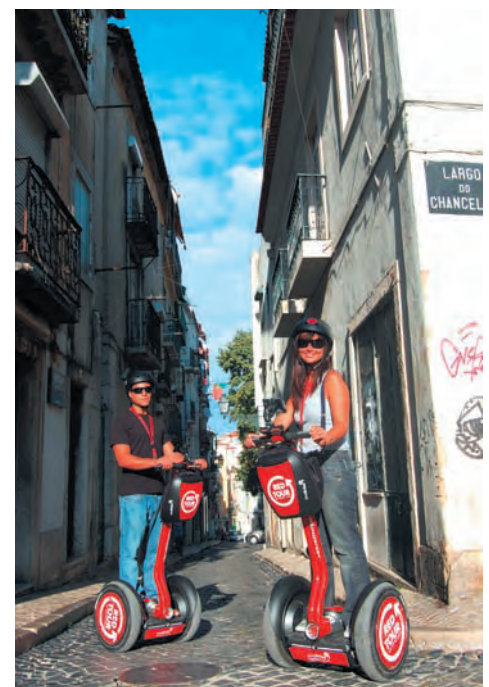
Segway tours - freedom to roam the city

The Port Authority has started construction of a new cruise quay in Santa Apolónia area at the heart of the city of Lisbon. A new cruise terminal is due to be ready in 2010, which will improve the way passengers and cruise ships will be welcomed in Lisbon in future.