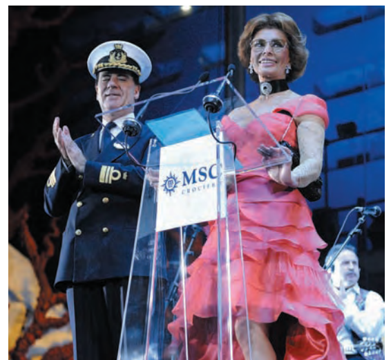
Capt Bossi leads Sophia Loren to the stage

Fireworks set to music and a gala evening on board concluded the ceremony.