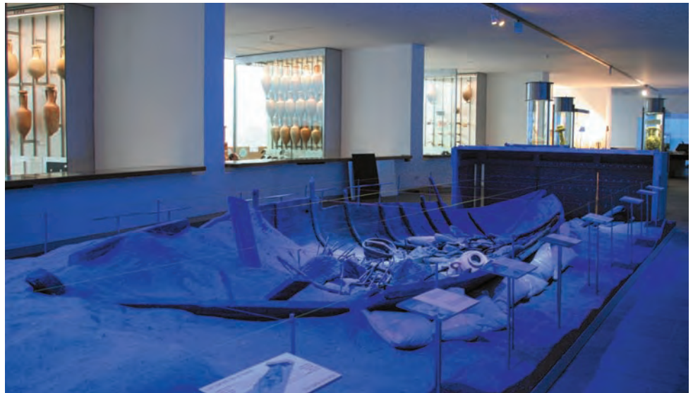
Creating an underwater feeling

The Museum also holds workshops and activities related to underwater archeology, an auditorium, cafeteria and a shop, making it not only an exhibition centre but also a cultural