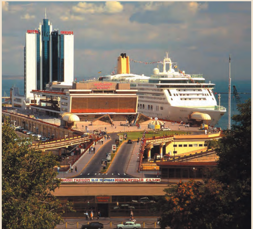
A view of the terminal from the famous Potemkin Stairs

Looking ahead, there are plans to reconstruct the passenger terminal and expand cruise-handling infrastructure at the Black Sea port, including additional berths. Currently the terminal can accommodate five vessels at the pier, which has a water depth alongside ranging from 9.5 up to 11.5mtr.