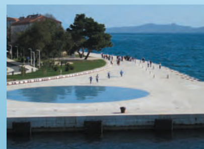
Sea Organ – a popular spot

The plans for a new passenger terminal in Gaženica (2 miles from the old town) are almost complete and the port authority will start construction work soon. The new facility should be ready in 2013.