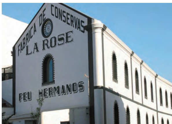
A converted fish canning factory includes an assembly line