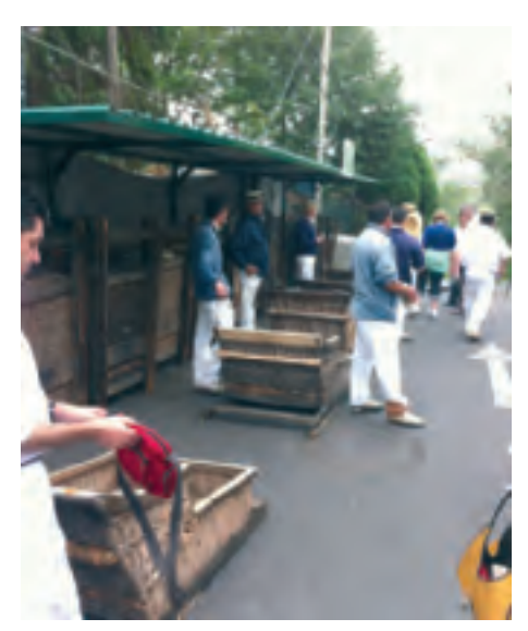
Must-do toboggan ride for all visitors