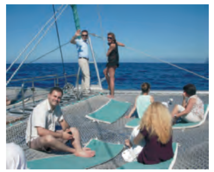
MedCruise members enjoy a sailing trip around the island