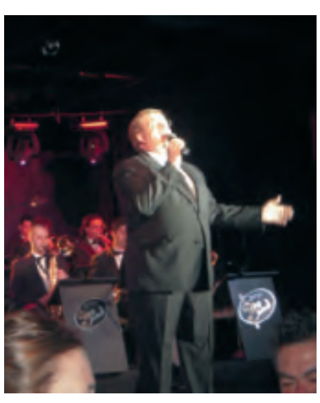
Delegates enjoyed a Gala Dinner at the casino with cabaret