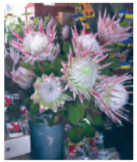
Flower market, Funchal