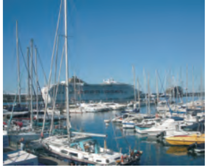
P&O Cruises' Oceana in port on the last day of the GA