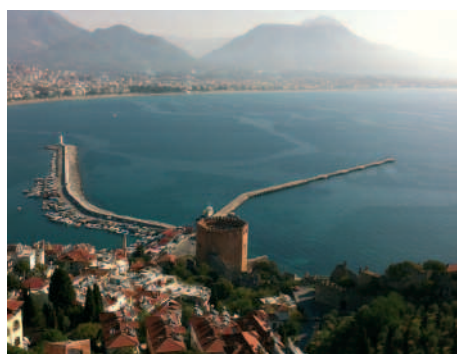
View of Alanya's cruise berth and Red Tower