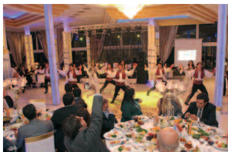
Gala Dinner with Turkish dance troupe