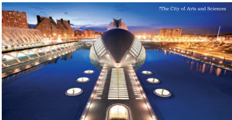
The City of Arts and Sciences

C ruise traffic at the Port of Valencia has grown 201% in calls and 745% in passengers over the last 10 years. In 2013, the Port Authority of Valencia (PAV) aims to exceed 509,000 passengers and 231 calls.