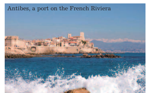
Antibes, a port on the French Riviera