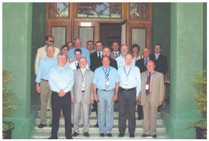
Cruise line executives and delegates outside Stalin's Dacha in Sochi