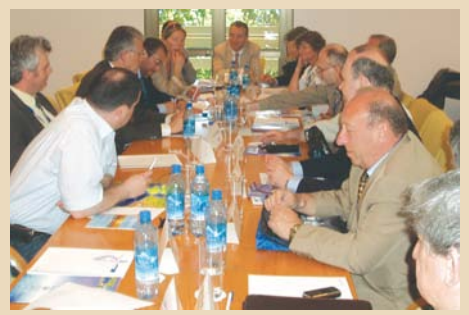
Black Sea revival under discussion

Predominant in the discussion was the call for a revival in Black Sea cruising, as during Soviet times, Black Sea cruises peaked with as many as 3 million annual passengers. Area port and ship owner association representatives proclaimed at the roundtable the goal of establishing a Black Sea country-owned cruise ship or line to serve pentup local demand for cruising, particularly in Russia. Discussions continued around tapping into the local source markets and in developing local