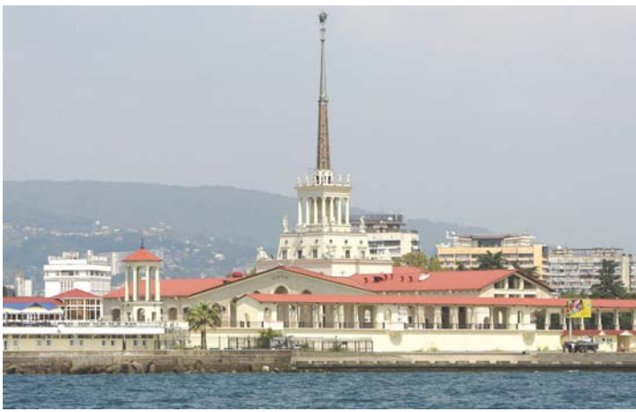
The town of Sochi