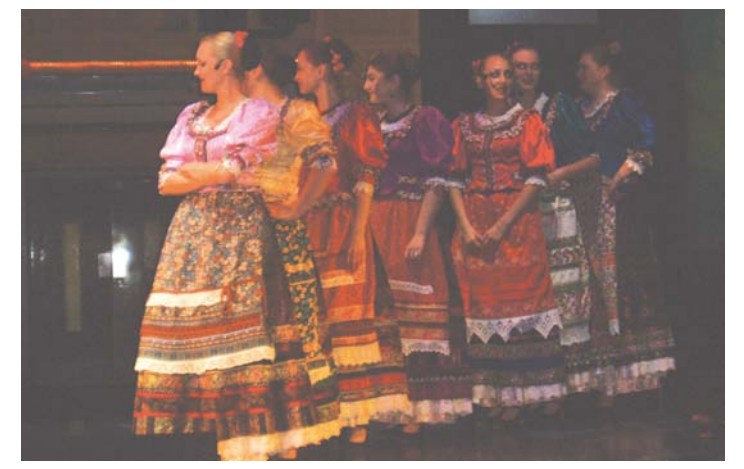
Gala surprise - traditional Russian dancing and singing