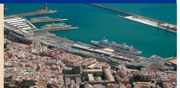
Almeria Port - welcomes delegates

Cruise passengers calling at the Port of Almeria can take a variety of shorex including the ancient Muslim Alcazaba Castle, Cabo de Gata Natural Park and the charming little white village of Mojacar.