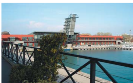
Venezia Terminal Passeggeri - venue for Seatrade Med

Venice's singular appearance, its countless attractions and wealth of art treasures make it unique. Anyone participating in Seatrade Med 2008 should take the opportunity either pre- or post- show to experience its many attractions.