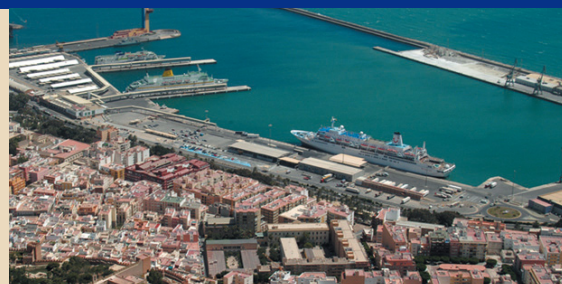
Almeria Port - welcomes delegates

Cruise passengers calling at the Port of Almeria can take a variety of shorex including the ancient Muslim Alcazaba Castle, Cabo de Gata Natural Park and the charming little white village of Mojacar.