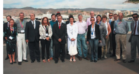
Guest speakers and media at Almeria port