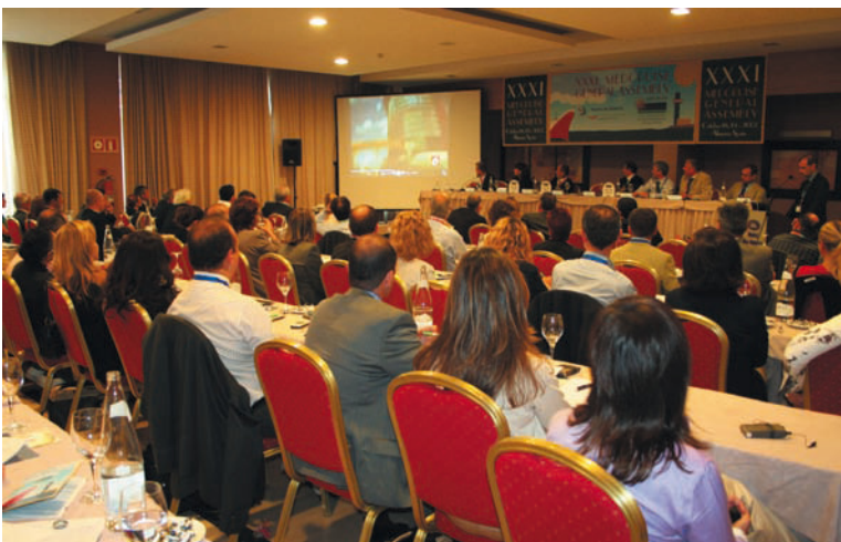
The General Assembly gets underway