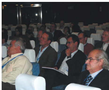
Students and instructors in classroom