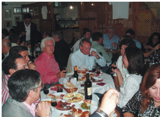
Delegates dine at Peña el Morato restaurant