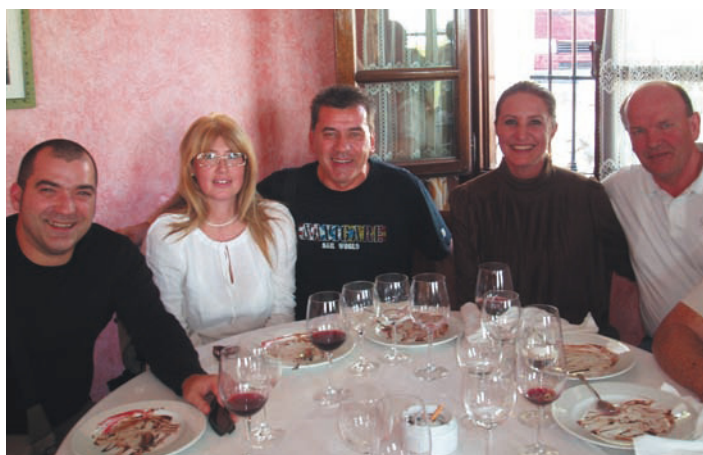
The Croatian delegation enjoy lunch in Grenada