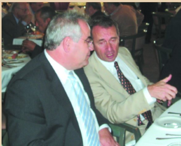
Former president and new exchanging views

spent five years working for different engineering software companies in Aix-en-Provence. In 1996 he was appointed director of ports for the Chamber of Commerce and Industry of Nice Côte d'Azur which collectively welcome 2m passengers a year.