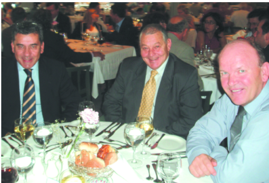
Delegates from Croatia enjoy a meal onboard The Emerald

Pictures here are a selection of photographs taken over the two days.