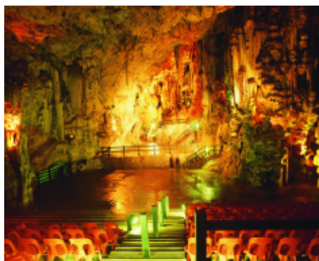
St Michael's Cave