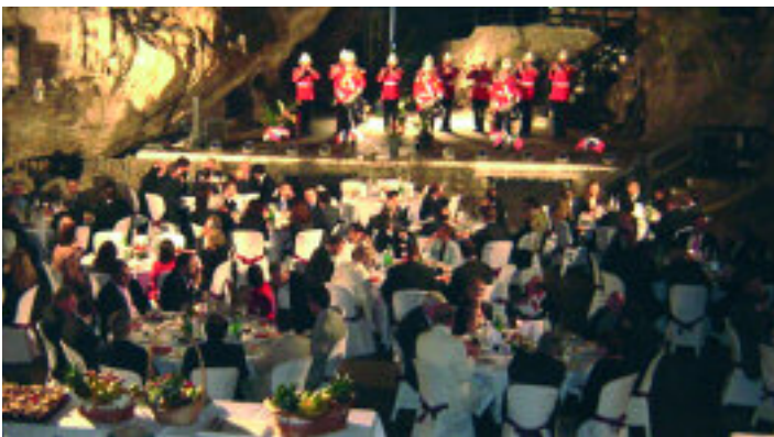
Members are entertained