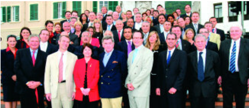
Cruise line executives, MedCruise board executives, and members converge in Gibraltar for 28th General Assembly