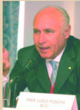
Foschi – year round view