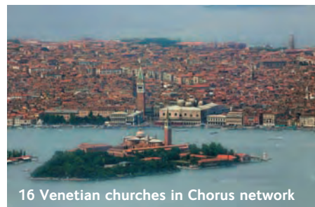
16 Venetian churches in Chorus network

M edCruise associate member Bassani, cruise ground handler and shipping agent operating along Italy's Adriatic coast, has signed an agreement with Chorus, one of the most important religious associations in Venice where the company is headquartered.