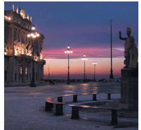
Trieste's Piazza Unità

Starting this year any passengers able to include an overnight stay in Trieste could also incorporate a visit to the operetta.