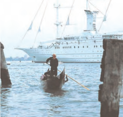
December meeting in Venice