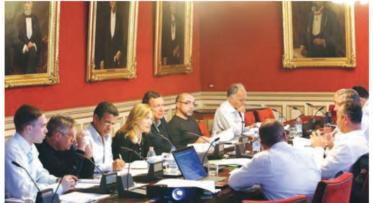
Board of Directors in discussion on the eve of the GA

T he 32nd General Assembly of the Association of Mediterranean Cruise Ports (MedCruise) was held in Trieste, Italy, on May 22nd and 23rd, with over 100 participants, including 81 delegates representing 36 port members and several associate members, plus new member candidates and observers, cruise line guest speakers, and trade press.