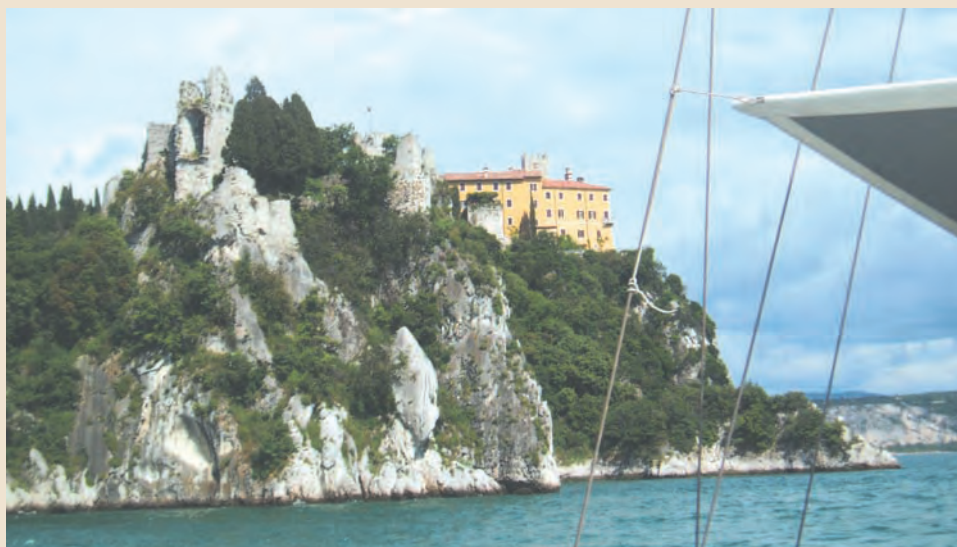
Cruise line executives sampled lunch at the Castle de Duino and visited the mosaics at San Giusto Cathedral