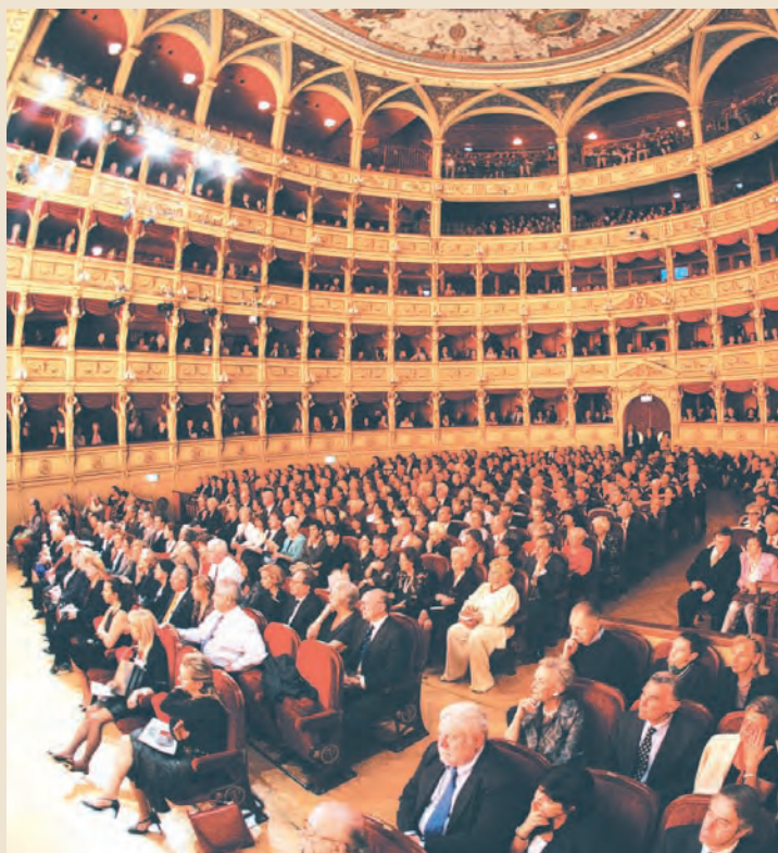
Delegates enjoy the Uto Ughi concert, Verdi Theatre

Cruise line executives and press representatives had a tour of Trieste and its environs taking in the port area, the Risiera di San Sabba concentration camp museum, San Giusto Castle and Cathedral, the Roman amphitheatre dating back to the first century AD, the castles of Miramar and Duino and finishing at one of the city's historic coffee houses.