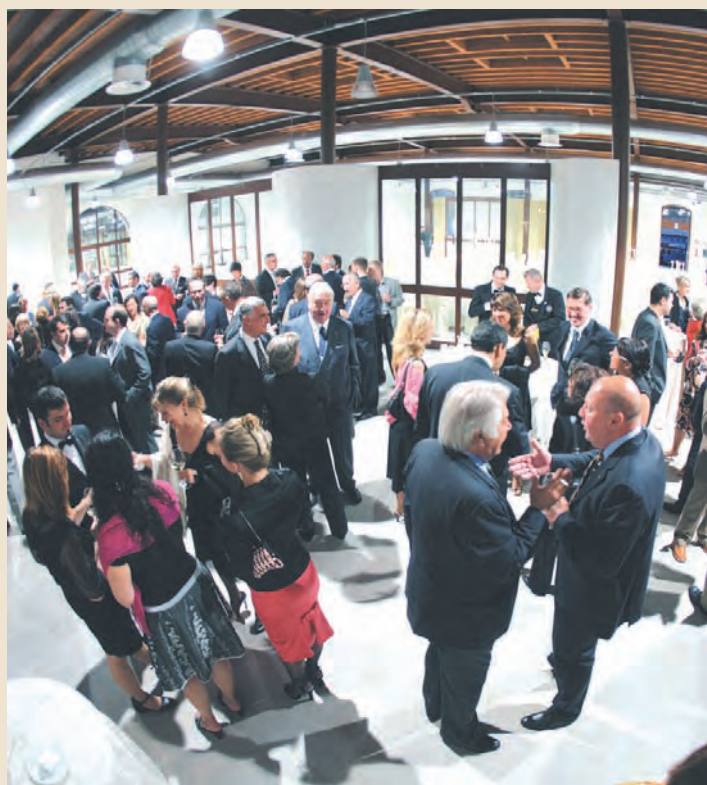
Gala Dinner hosted by Trieste Port Authority