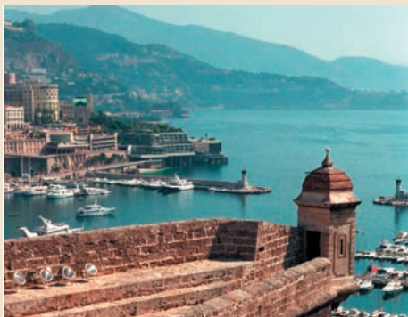
Next stop Monaco....Monaco will host the next General Assembly on October 29th-30th.

'We need the IMO or class societies to draw up a set of standard rules before ports can make the investment in shoreside facilities,' he said.