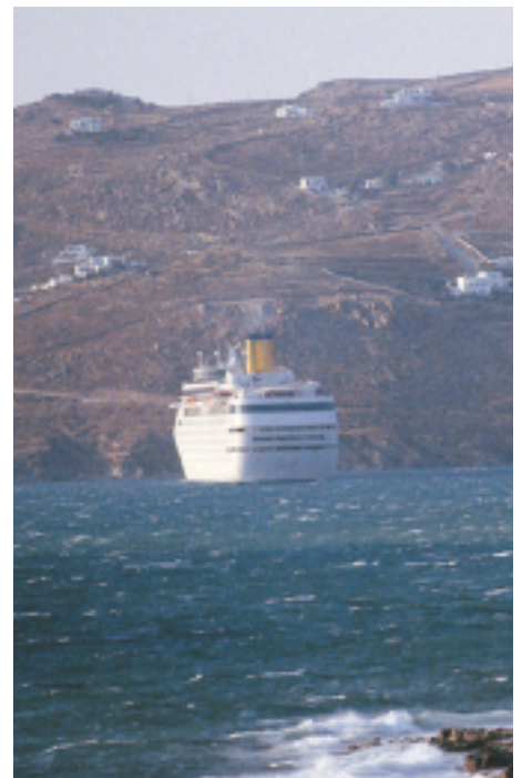
■ Costa Classica will be the inaugural visitor at Ancona's new terminal

The Terminal will be alongside one of the biggest quays in the port, with an area of 20,000 sq mtr that will be completely renovated to accommodate cruise services.