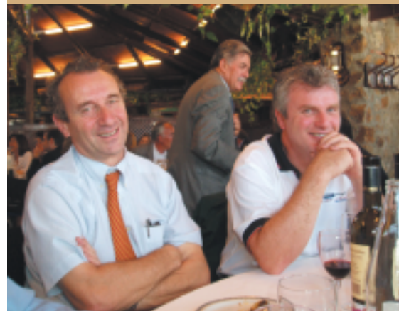
A light lunch