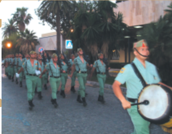
Ceuta march past

Every Thursday evening throughout the year Ceuta citizens turn out to watch the soldiers march past and raise the Spanish flag in the town centre