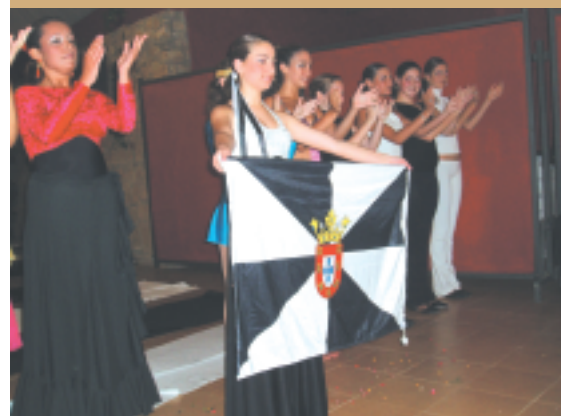
Dances of the four religions

The dance of the four religions: local ladies perform traditional Jewish, Muslim, Indian dances and the Flamenco to represent the four cultures who live in harmony in Ceuta