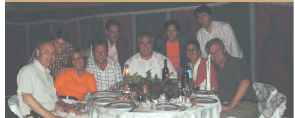
Dinner under the stars

An exotic traditional Moroccan open-air dinner under the stars finished off the Ceuta general assembly in grand style