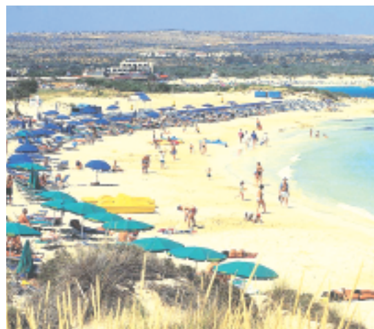
■ MedCruise general assembly will be held October 19-21 2005 in Limassol, Cyprus, where the new presidency will be decided

Another initiative which I think has worked