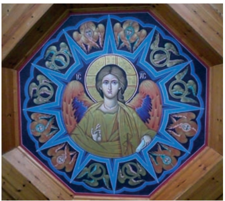
Iconography from within one of the monasteries

eteora, in northern central Greece, is one of the most remarkable places in the country and is accessible on a full day shore excursion from Port of Volos. Medieval monasteries hang precariously along the sides of giant rock formations – the name Meteora comes from the Greek word 'meteoros', meaning 'suspended in air'.