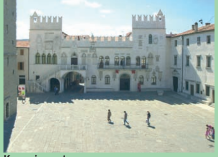
Koper's main square

Slovenia presents a charming patchwork of landscapes: high mountains with lake districts, wooded uplands, verdant valleys, the mysterious karst and a sunny slice of Adriatic coast. All the regions offer a wide range of gastronomic and oenological specialities.