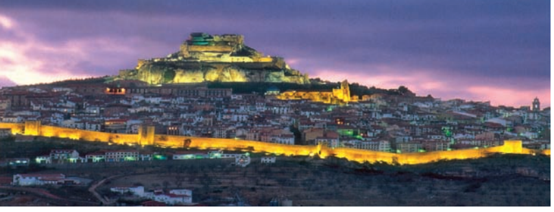
The Castle and Walls of Morella

The historical walled area of the town deserves special interest. At the top of the hill, the castle offers outstanding views. Other historical buildings worth a visit include the Archpriests Church, the Gothic Cloister of the