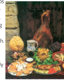
Fine Morellan cuisine

Restaurants along the coastal area of Morella offer shellfish. Visitors should also try the local vegetables (especially artichokes) and rice dishes.