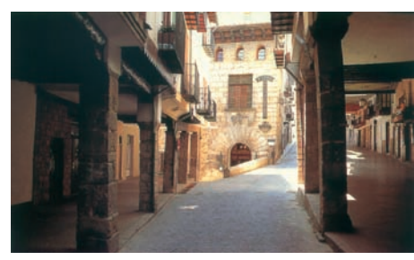
A typical Morellan street

and diminutive chapels come into view at each