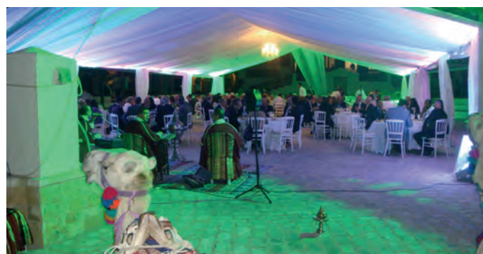
The gala dinner held under a tent, quayside at La Goulette