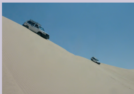
4x4 trip over the dunes