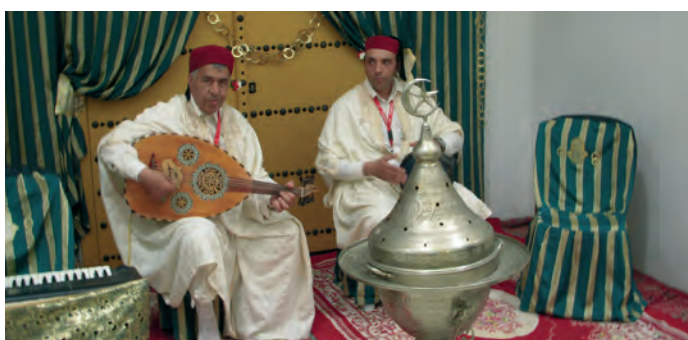
Local musicians greet passengers as they pass through the Village Harbour