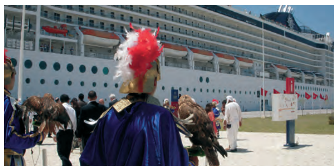
MSC Orchestra berthed at La Goulette during MedCruise GA