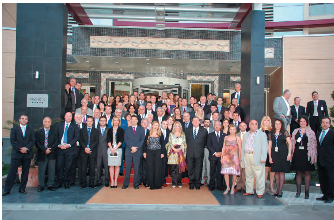
Over 100 participants from the Mediterranean Sea and surrounding areas attended the 36th General Assembly in Constantza, Romania.

He announced MedCruise membership had grown to 60, representing over 80 ports, including four new members: Bourgas (Bulgaria); Lisbon (Portugal); Marseille (France) and North Sardinian ports of Olbia, Golfo Aranci and Porto Torres (Italy). Associate membership has risen too to 23 with Select Black Sea (Odessa), Karpaten Turizm (Constantza) and Cemar (Genoa) officially welcomed at the GA. Detailed information all new member ports will appear in the September MedCruise News.