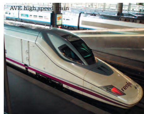
AVE high speed train