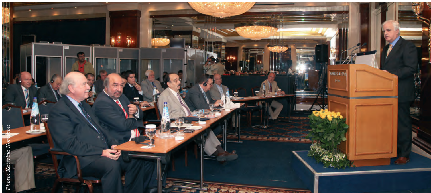
Ioannis Diamantidis, Minister of Maritime Affairs, Islands and Fisheries speaking with Piraeus Port President Yiorgos Anomeritis and Deputy Minister of Tourism George Nikitiades in the audience.