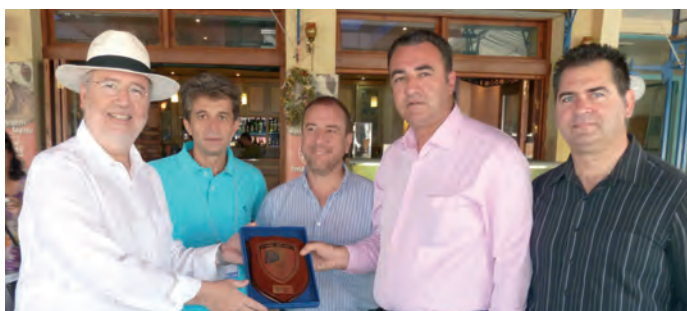
PPA's Hatzakos (L) hands token of appreciation to Mayor of Poros