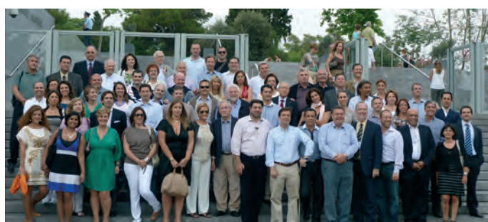
MedCruise members given tour of Acropolis Museum