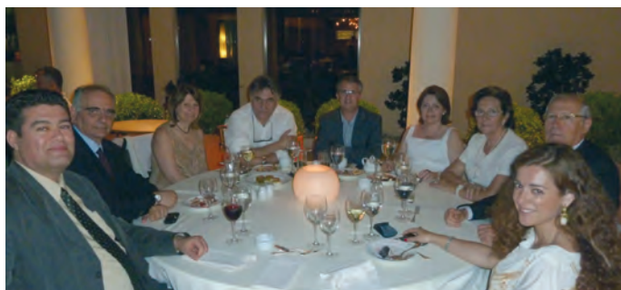
PPA hosts lavish evening meal