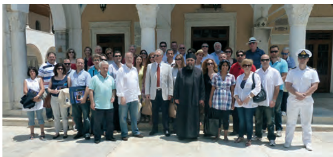
MedCruise excursion to Hydra Town Hall