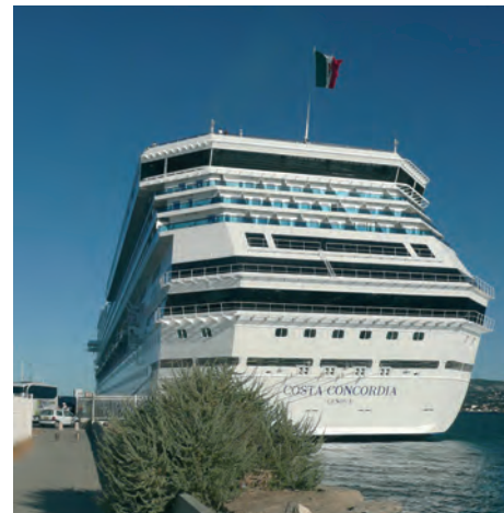
New order will be an evo of Concordia class

Costa Crociere signed a newbuild order with Fincantieri for a 132,500gt ship with 4,928 maximum passenger capacity. The vessel will be built at Marghera shipyard and is scheduled to be delivered in October 2014. It will be the largest Italian cruise ship and the tenth ordered from Fincantieri by Costa in 10 years.