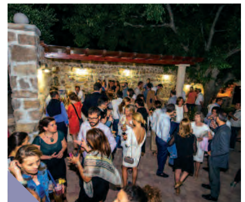
Dinner at Raznjevica dvori