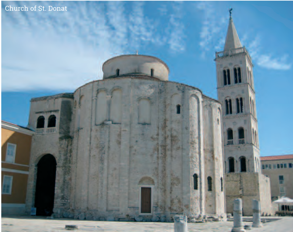
Church of St. Donat

Cruise line execs attending the 46th GA of MedCruise in Zadar had a chance to view the city, the new port and its surrounds.