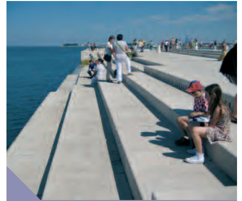
The Sea Organ

Finally a visit to a family-owned farm called Roca about 45 minutes from the city. Roca produces some of Croatia's finest agricultural products, particularly ham. The farm serve up their own prosciutto, cheese, bread and wine.