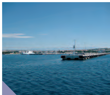
Zadar's new port at Gazenica