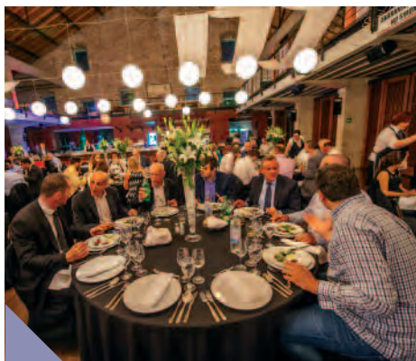
Gala dinner at Arsenal