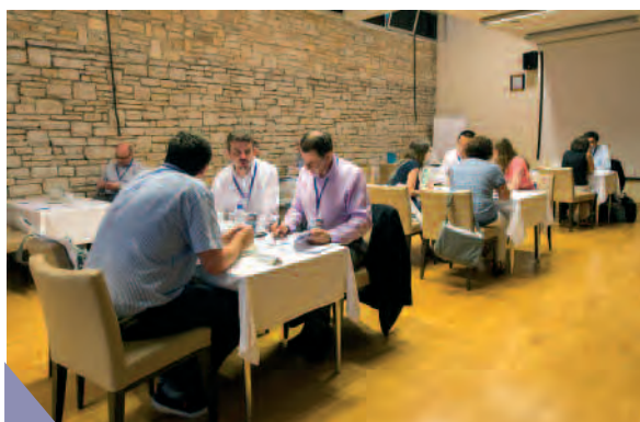
B2B meetings between cruise lines and ports and the press and ports