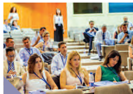
Members at the conference