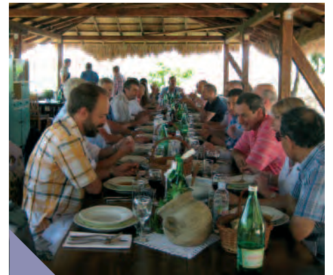
Lunch at Roca