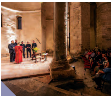
Music at St. Donats church