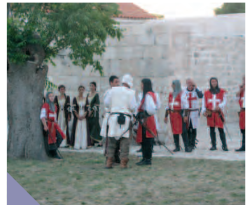
Maskovica Han re-enactment