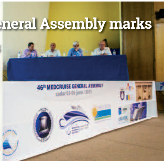
Cruise Line executives panel at the MedCruise General Assembly

MEDCRUISE GENERAL ASSEMBLY zadar 03-06 june / 2015