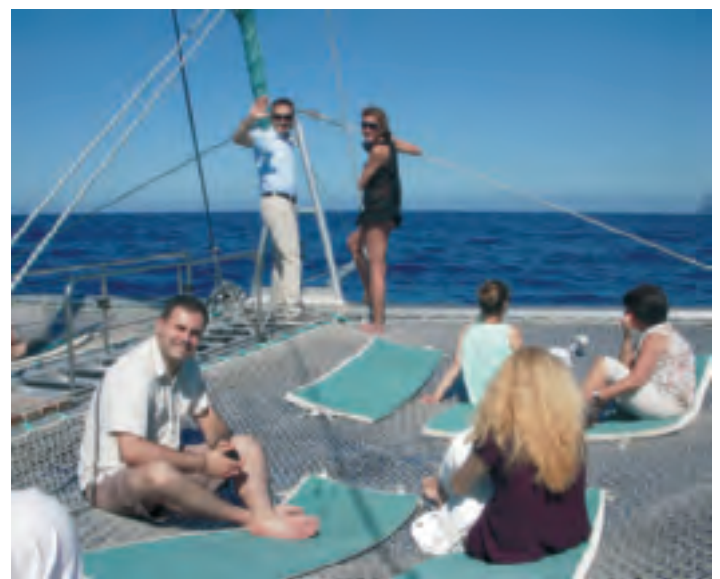
MedCruise members enjoy a sailing trip around the island