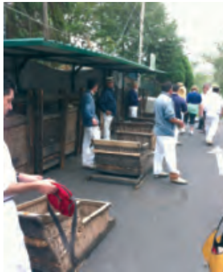
Must-do toboggan ride for all visitors