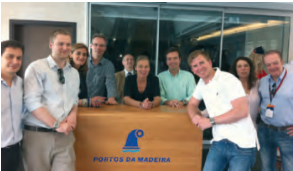
Cruise line executives visit Funchal's Cruise Terminal