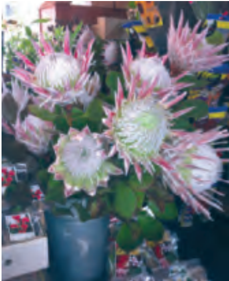
Flower market, Funchal