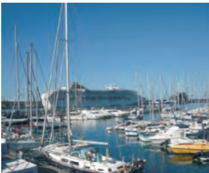
P&O Cruises' Oceana in port on the last day of the GA