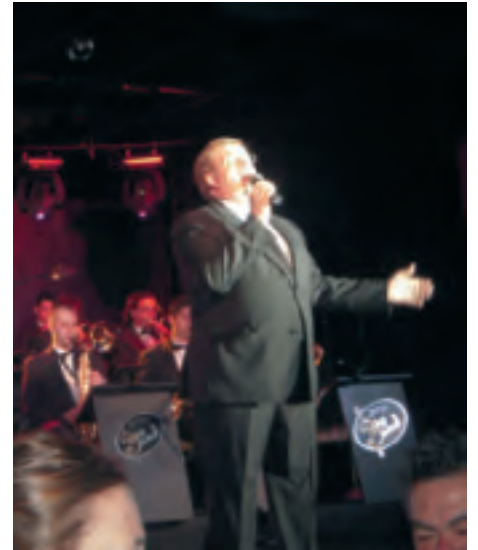
Delegates enjoyed a Gala Dinner at the casino with cabaret