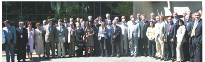
Delegates catch some sunshine outside the Radisson SAS Lazurnaya during conference coffee break