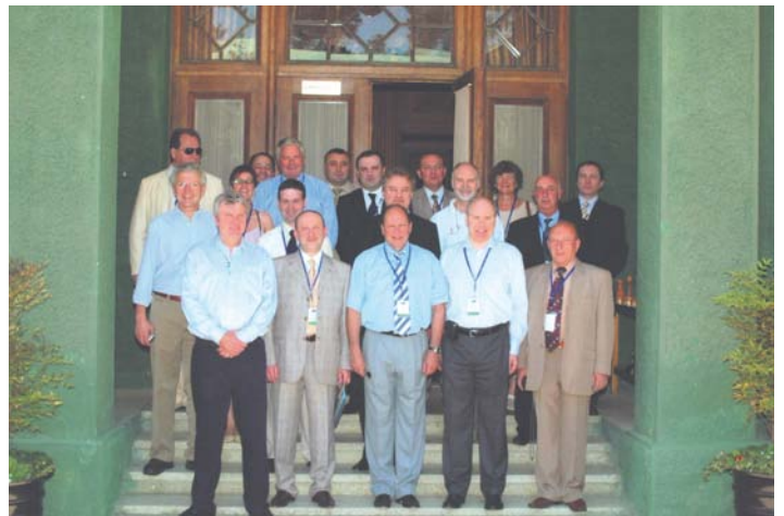
Cruise line executives and delegates outside Stalin's Dacha in Sochi