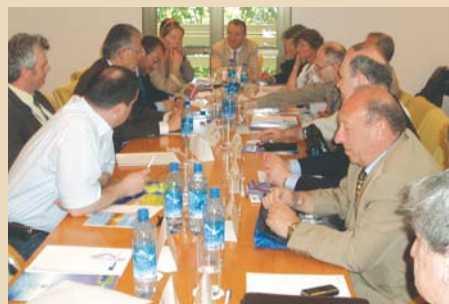
Black Sea revival under discussion

Predominant in the discussion was the call for a revival in Black Sea cruising, as during Soviet times, Black Sea cruises peaked with as many as 3 million annual passengers. Area port and ship owner association representatives proclaimed at the roundtable the goal of establishing a Black Sea country-owned cruise ship or line to serve pent-up local demand for cruising, particularly in Russia. Discussions continued around tapping into the local source markets and in developing local