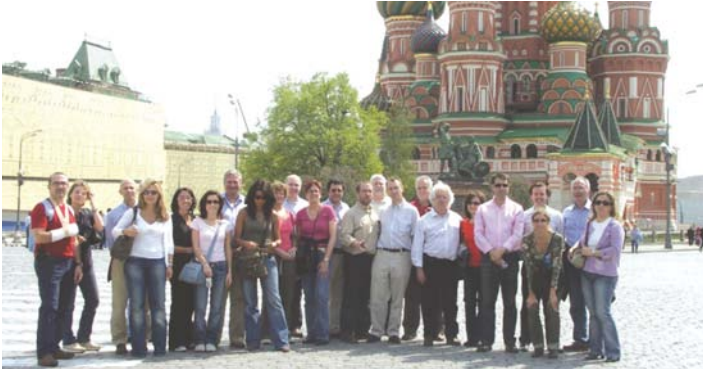
From Russia with love ... MedCruise delegates see the sights of Moscow

The Sochi general assembly started miles away in Russia's capital city of Moscow, where a number of delegates gathered together with the members of the MedCruise board for a day's sightseeing before jetting off to Sochi in the evening. This picture gallery highlights the Moscow trip, sightseeing around Sochi and the evening entertainment plus a report from the conference sessions.