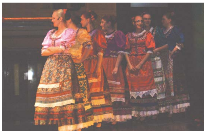
Gala surprise – traditional Russian dancing and singing