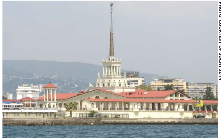
The town of Sochi